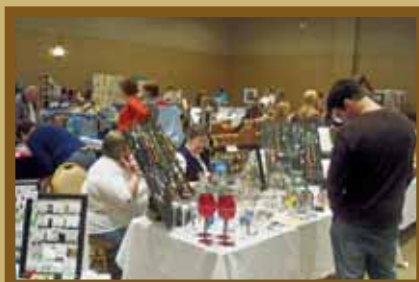
The 1st Annual Holiday Bazaar hosted over 70 vendors with a wide variety of hand-made crafts and other unique items.

As you can see, we have a host of different functions happening at Legacy. I am excited to begin marketing our ballroom to the corporate market. My goal is to see the ballroom used during the week and weeknights as well. If you work for a company or know of someone looking for a great space for speakers, sales meetings or awards ceremonies and more...help spread the word about our wonderful, versatile space. I look forward to updating you in the Spring when our ballroom will be in full-swing wedding season!