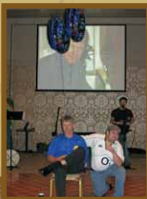
The birthday boy gets roasted!