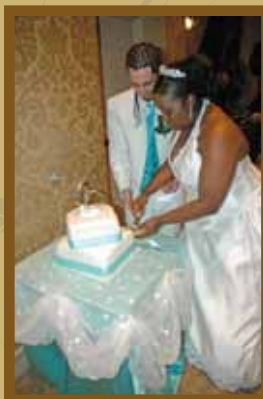
Bride and groom cutting the cake.