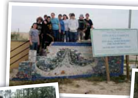
The group at the site of the future Waveland City Hall Complex.