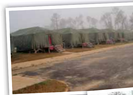
On-site tents serve as the group's quarters.