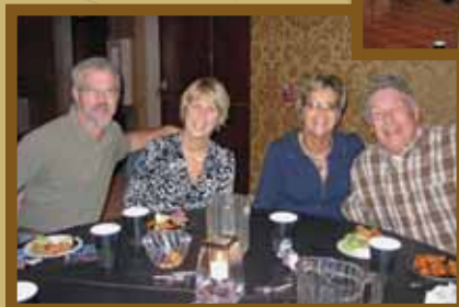
Guests enjoy the simple, casual atmosphere at a recent 50th birthday party.