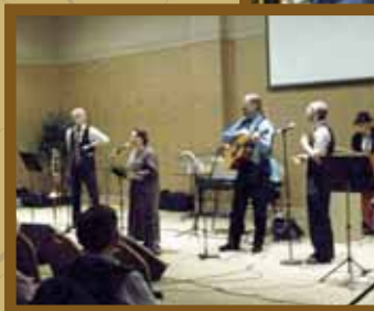
Toes were tapping to the Klezmer-style music of The Old World Folk Band.