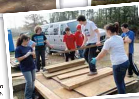
Shaarai youth got hands-on building experience.