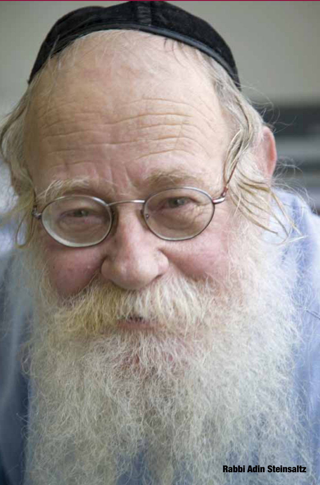
Rabbi Adin Steinsaltz

Volume 6 • Issue 1 • Fall 2010 • Elul 5770 – Kislev 5771